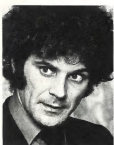
Peter Maxwell Davies