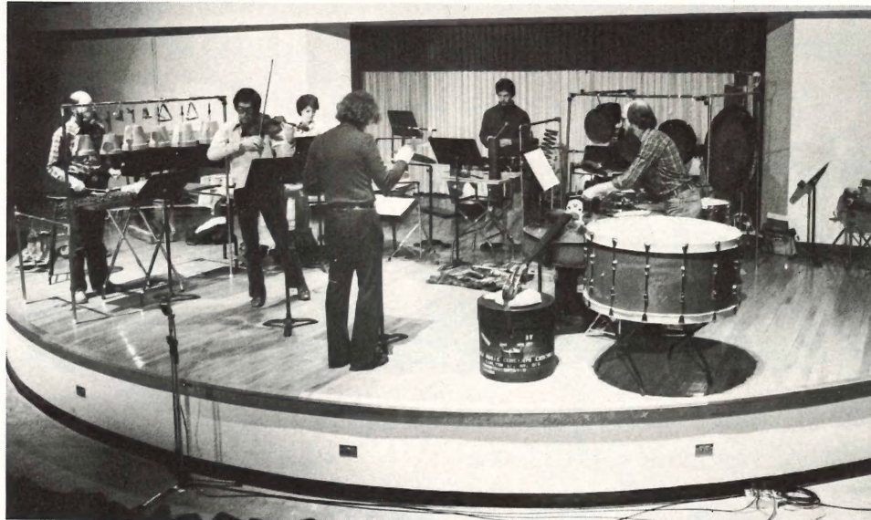
New Music Concerts rehearsing Lou Harrison's Concerto for Violin and Percussion Orchestra last season in Walter Hall

A must for all who want to hear the most innovative and provocative works composed today